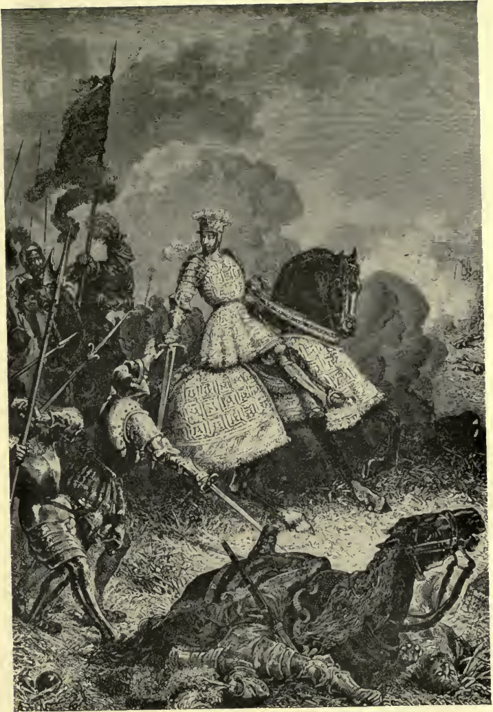
BATTLE OF AGNADILLO